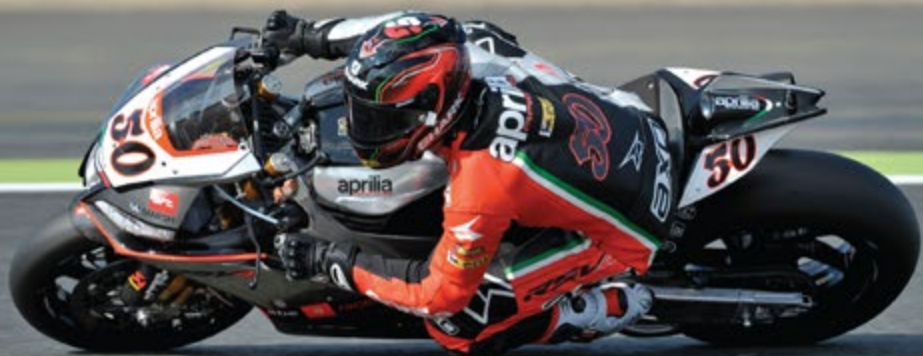
Sylvain Guintoli, Aprilia Racing Team, 2014 FIM SBK World Champion